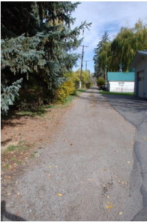
Alleys, streets and sidewalks