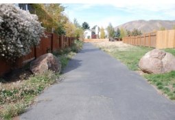
Neighborhood footpaths (paved or unpaved)