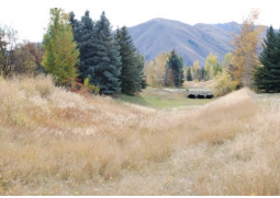
Drainage ditches and canals